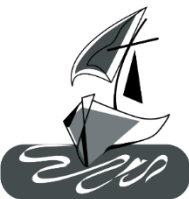
Calling & Engagement