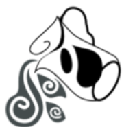
Love & Justice