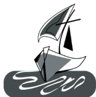
Calling & Engagement