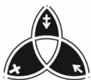
Open & Affirming