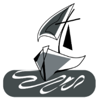
Calling & Engagement

One of the ministries the Parish Care Committee coordinates is finding people who would like to help provide a meal for someone or a family who may be experiencing a trial of the spirit or time of joy as we say in our covenant together. This is one way to give a little extra love and support.