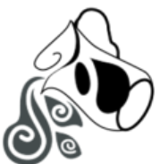
Love & Justice