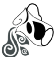
Love & Justice

A significant portion of the money we pledge each year to UCUC goes to our work for Love & Justice. How do we turn those dollars into something meaningful?